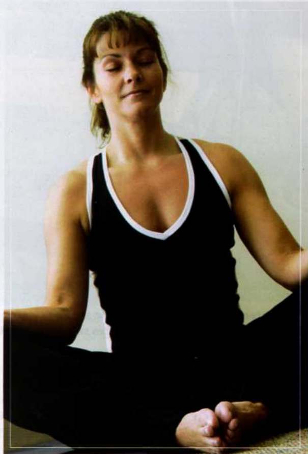
Those practising yoga, naturally exude vitality.

Breakfast is a must in your quest for all day energy. Add protein to keep you full for longer and fruit such as berries for an extra kick of